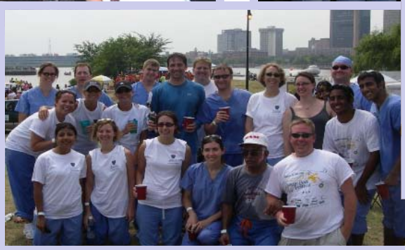
Univ. of Toledo Residents & Staff at Maumee River Dragon Boat Festival