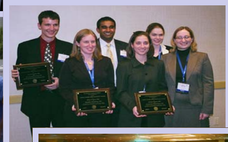
2007 Dyson Winners & Resolution Assembly