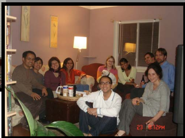
Some of the Beaumont residents at one of their relaxing dinners!