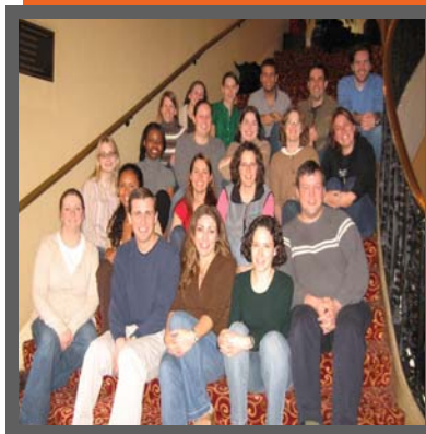
Resident Executive Committee In Chicago

3. Communicate the values of continued AAP membership beyond residency.