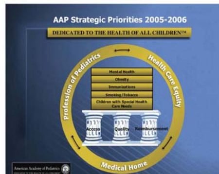
AAP Strategic Plan 2005-2006

You can also learn more about the District III Resolutions that were adopted last year by visiting the Members Only Center and clicking on the link "Annual Leadership Forum" on the far right hand side of the screen.