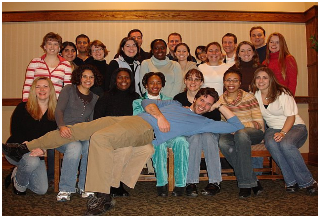
2006-2007 Resident Executive Committee Long Range Planning Meeting, Chicago, IL