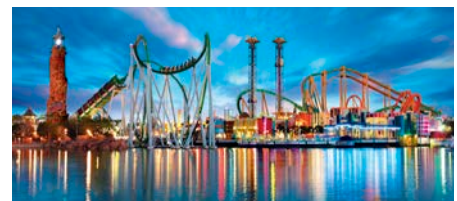
ORLANDO, FLORIDA (UNIVERSAL) DECEMBER 6-8, 2024