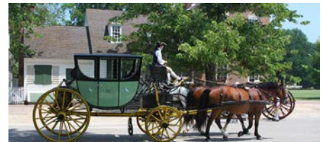
WILLIAMSBURG, VA JUNE 21-23, 2024