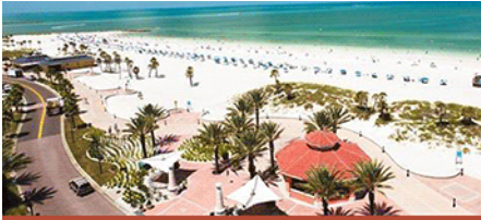
CLEARWATER, FL NOVEMBER 10-12, 2023