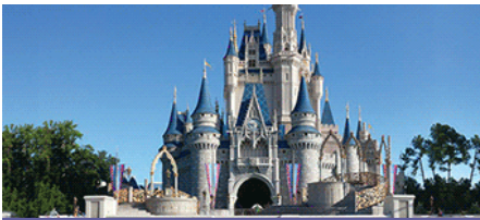
ORLANDO, FLORIDA (DISNEY) MARCH 22-24, 2024