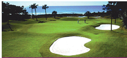
HILTON HEAD ISLAND, SC MAY 24-26, 2024