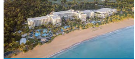
RIO GRANDE, PR FEBRUARY 2-4, 2024