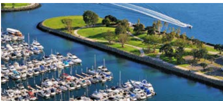
SAN DIEGO, CALIFORNIA AUGUST 30-SEPTEMBER 1, 2024