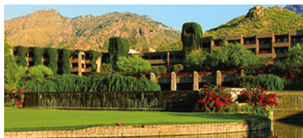
TUCSON, ARIZONA NOVEMBER 15-17, 2024